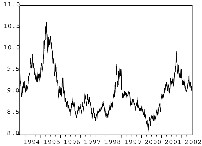
Figure 1: The SEK/EUR exchange rate

Sample: 1.1994-6.2002. Note that for observations prior to January 1, 1999, we use DEM instead of EUR. Before January 1, 1999 the majority of SEK trading was conducted in DEM as it is currently conducted in EUR.